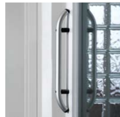
It's often the details that make the design. We have many to choose from.