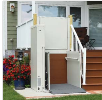
Vertical Platform Lifts